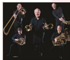
Prince Bishops Brass