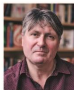
Simon Armitage