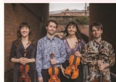
Treske Quartet © Inis Oirr Asano